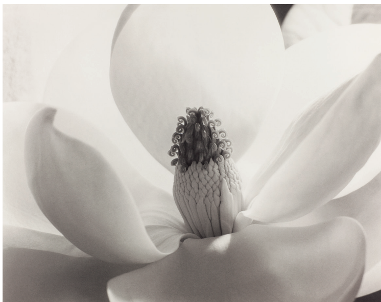
Imogen Cunningham, Magnolia Blossom , 1925

A selection of photographs from the Per Amor a l'Art Collection showing different approaches to the representation of the plant world.