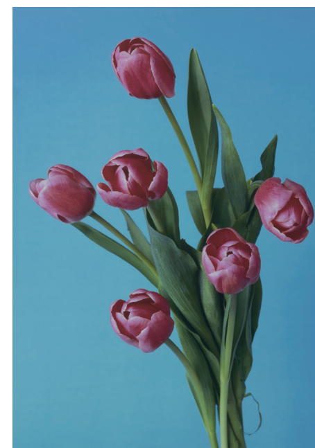
Hans-Peter Feldmann, Blumenbild (Picture of Flower) , 2006 © VEGAP, València, 2020

of formal repetition ends up dissolving time and aesthetic stances. Photographers such as Hans-Peter Feldmann and Mathieu Mercier have offered new approaches to this way of composing, with the former taking it even into kitsch . Other approaches address a decolonial narrative. The collage work of Alessandra Spranzi, the oeuvre of Jonas Mekas and the journeys of Pierre Verger contribute to this overview as additional testimonies regarding ways of portraying the plant world. The exhibition ends with a room by Jochen Lempert, in an installation that blurs the boundaries between desire, botanical representation and personal idiom.