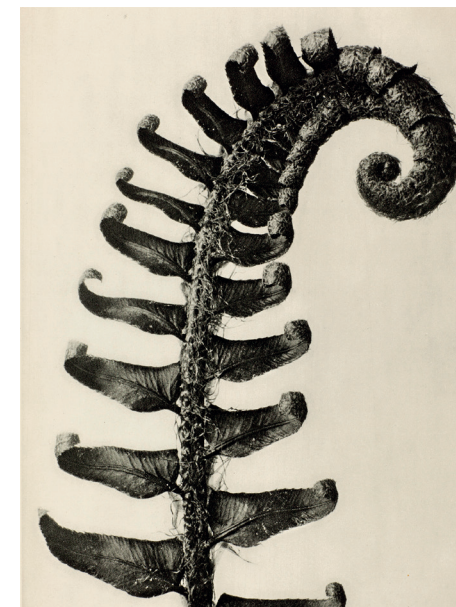
Karl Blossfeldt, Polystichum munitum. Urformen der Kunst (Art Forms in Nature) , 1928

Botanical analysis and its representation has constructed an imagery and an aesthetic of the representation of a flower—a frontal, descriptive view that isolates the flower from its setting. Such compositional subconscious is shared by different artist in this exhibition. The play